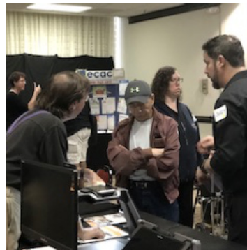
DeafBlind participant discussing about products with a vendor