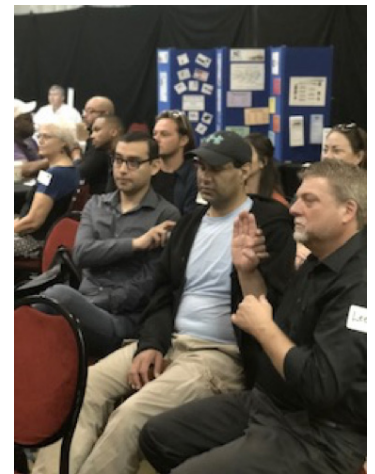
DeafBlind participant (center) with two tactile interpreters